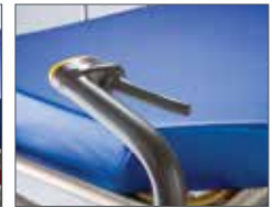
Active Hand Brake