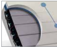
AccuMax® VPC Surface