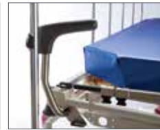
Ergonomic Push Handles with Exclusive IV Pole Holder