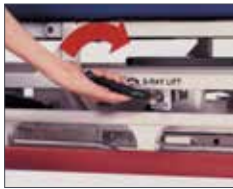
Cassette Locking Lever

A safe and comfortable experience for both you and your patient starts on a Hill-Rom® stretcher.