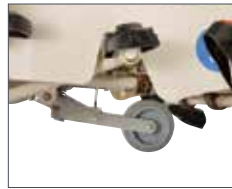
Steering Plus™ System