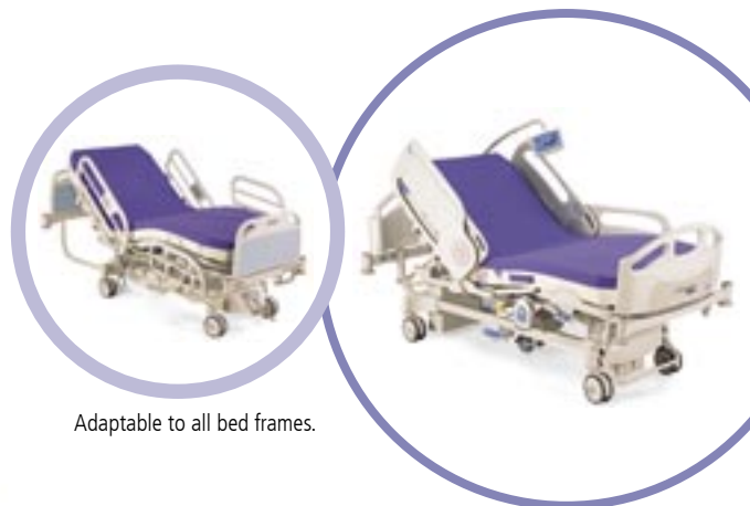
Adaptable to all bed frames.

High quality, visco elastic polymer product range includes: mattress replacements, overlay mattresses, stretcher mattresses, seat cushions and lower leg supports.