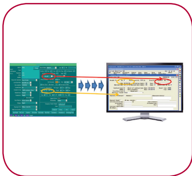
Automatic data transfer to newborn record