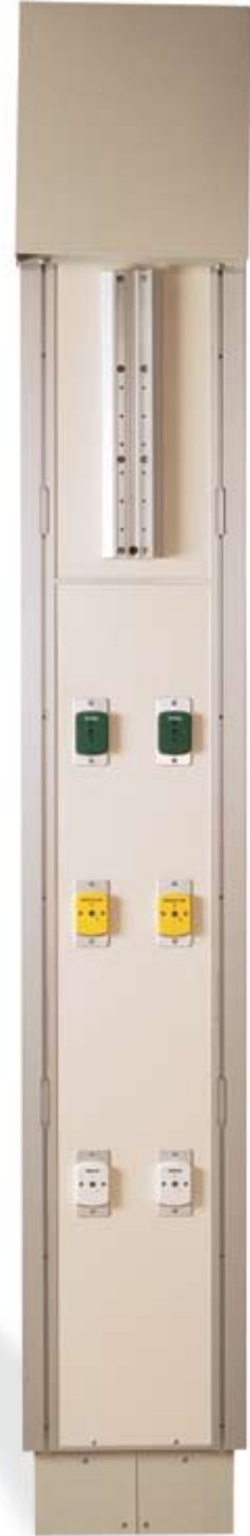
Small Power Column Front View

Hill-Rom reserves the right to make changes without notice in design, specifications and models. The only warranty Hill-Rom makes is the express written warranty extended on the sale or rental of its products.