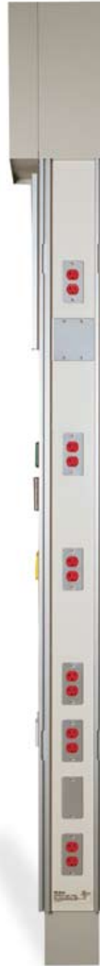
Small Power Column Side View