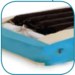
Air cylinders and air reservoirs