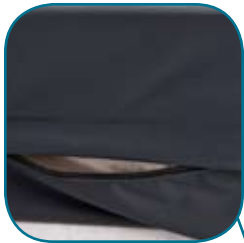
Three-sided zip and inside flap