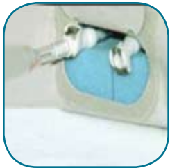
Inflation ports with air pump