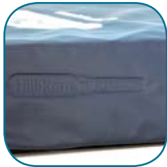
Embossed manufacture date