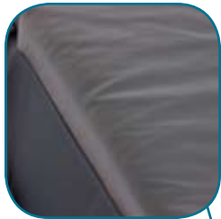
RF welded seams