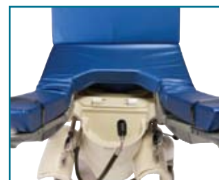
Factory Mounted Light