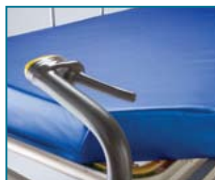
Active Hand Brake