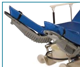
Integrated Foot Supports